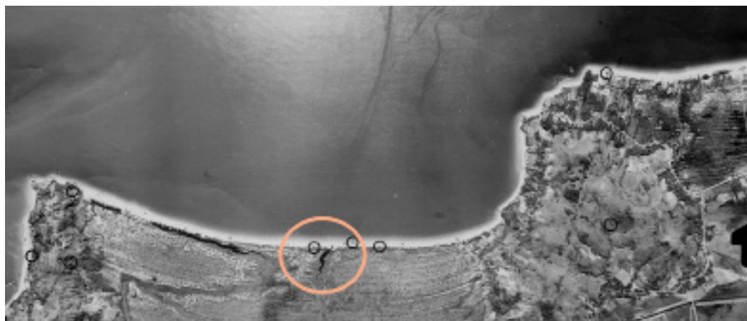
Two main areas were excavated by natural layers, RM I and RM II, with a surface of 448 m 2 . There is no direct connection between the two areas but they share a similar material culture and stratigraphic aspect. The RM II area, which presented the bigger extension (350 m 2 ) and received higher attention during the excavation, with all layers carefully screened through a 1 or 2 mm sieve (FOSSARI, 1998; 2004), is the focus of this study. No extensive laboratory work has been done at the time and most of the material remained unprocessed until 2014, when the collection received new attention by a mixed team of the LEIA-UFSC ( Laboratório de Estudos Interdisciplinares em Arqueologia ) and MarquE-UFSC, by the financing obtained with the Program Elisabete Anderle de Estímulo à Cultura, Prêmio Catarinense de Museus Elisabete Anderle, Modalidade de Pesquisa , promoted by Fundação Catarinense de Cultura (GONDIM; SCHERER; GILSON, 2017). Figure 2: Aerial photography of the Rio do Meio river in 1957.

Situated on the waterfront in a dune area with current dense vegetation of restinga , the site is on a beach ridge plain which is delimited at the east and west by an elevation of Precambrian rocks, still covered by a Neotropical forest, and by a mangrove at the south (FOSSARI, 2004). From the ecological perspective, its condition is privileged once the site is located in the entrance of a bay and close to an estuary formed by the flowing of the Rio do Meio river. In recent decades, the strong wave action has slowly closed the Rio do Meio river mouth, which certainly had greater affluence in the past (FOSSARI, 2004) (Figure 2).